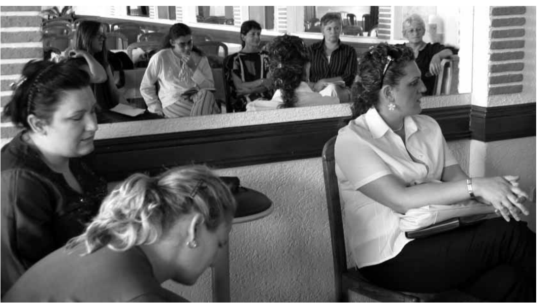
In working group name, (left to right) discuss future horizontal networking activities for WPC. 55

Following an hour and a half session and a lunch break, each working group presented on their discussion and recommended future activities.