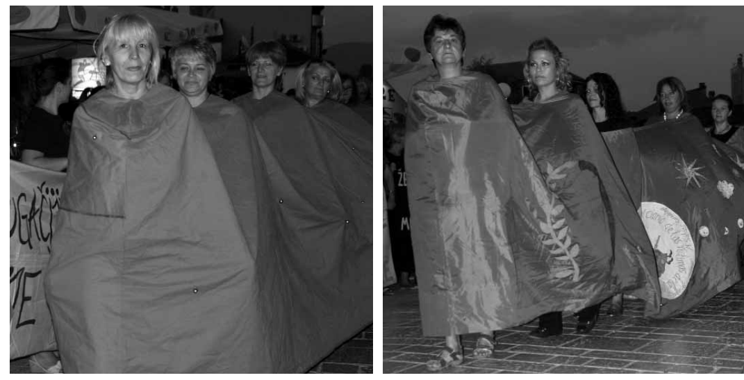
WPC plans to organize more public demonstrations, like this one held during the conference in Struga. Activists dressed like caterpillars to signify transformation.