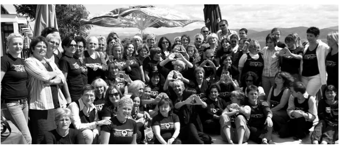
Participants in the first annual Women's Peace Coalition conference in Struga.

In addition to this statement and the strategic planning that occurred, the conference provided an important space for activists to share their personal experiences of the war and begin healing processes. WiB activists issued the first ever public apology for the crimes committed against Albanians in 1999 and the years leading up to the war. Their statement was later broadcast on Kosovo tel-