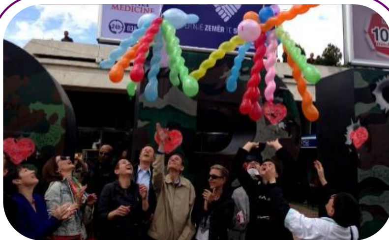
Participants release balloons in front of Prishtina's Newborn statue on May 17.