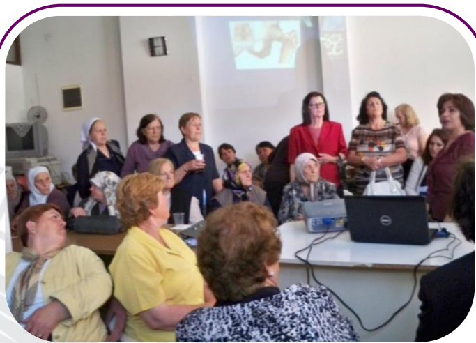
A doctor at Vita Jeta provides information about osteoporosis to the organization's members on 27 May.

Vita Jeta has received support for this work from the Kosova Women's Fund, supported by Kvinna till Kvinna.