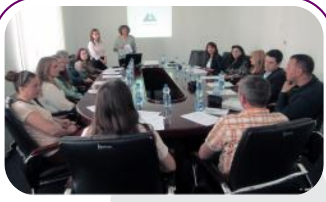
Women and men discuss the topic "Women's rights in property division and inheritance rights" at a presentation organised by PK on May 28 in Lipjan.

This initiative was supported by the KWN KWF, financed by Kvinna till Kvinna (KtK).