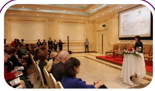
President of Kosovo Atifete Jahjaga speaks at the presentation of the report Gender Equality in Commerce, organized by Contract Law Enforcement (CLE) Program on Jun. 3 in Prishtina.

In Kosovo, statistics show that the rate of unemployment among women is 40%; women make up