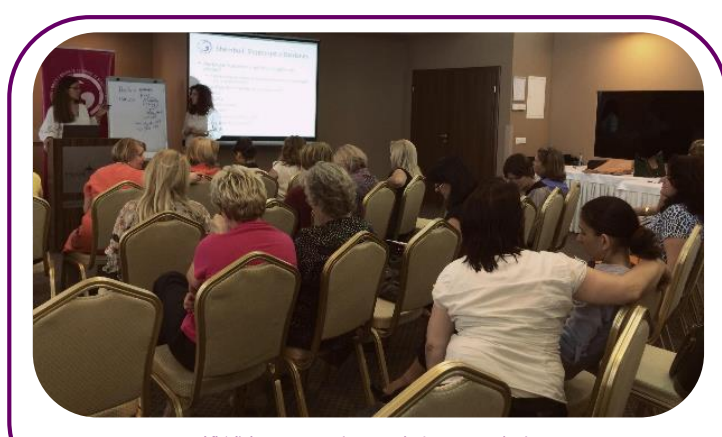
KWN organised a workshop entitled "Doing Research: Quantitative & Qualitative Methods" on Jun. 9.

Then, the 21 members participating discussed specific examples of KWN members' upcoming research initiatives. <u>Shqiponjat e Dardanes</u> from Graçanica and <u>Femrat Aktive te Gjakovës</u> (Active