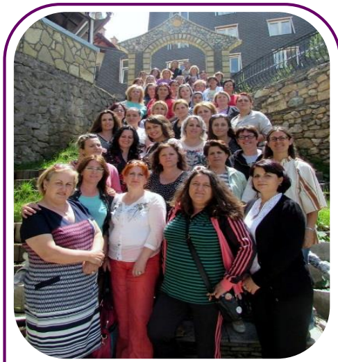
Gender Equality Advocacy Groups (GEAG) from 15 different municipalities participated in the second workshop on 26-27 Brod, Dragash

GEAGs bring together women in politics and women in civil society in efforts to advocate for women's rights and gender equality at the municipal level. This activity was supported by the Austrian Development Agency (ADA).