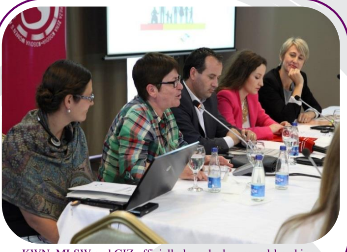
KWN, MLSW and GIZ officially launched a ground-breaking new report entitled Budgeting for Social Welfare.

Drawing from these findings, the report proposes concrete ways that MLSW can improve the efficiency and effectiveness of its budget, contributing to gender equality and improving social welfare, as a government priority stated in the Medium Term Expenditure Framework.