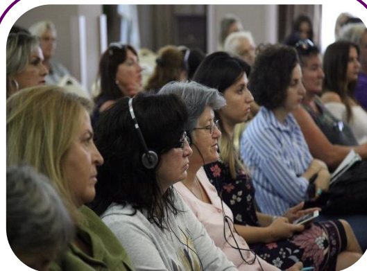
KWN members during the quarterly membership meeting, held in June in Prishtina.

KWN disseminated information on FemACT's Facebook page, trying to involve girls and boys in various activities. This year, KWN engaged 269 young women and men, through work at KWN or activities.