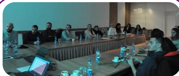
Students learn about sexual harassment and the legal framework for addressing it.

Also, in cooperation with 'Hasan Prishtina' University of Prishtina (UP), KWN, Artpolis and the Kosovo Center for Gender Studies (KCGS) were part of the working group for drafting the UP regulation and action plan on reporting and prevention of sexual harassment at UP. From next year, the UP will have functional mechanisms in place to address sexual harassment.