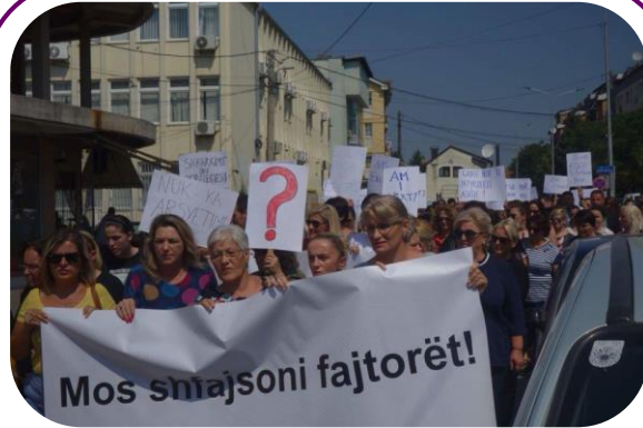
On August 10, in Gjakova a protest was held to say stop murdering girls and women!

KWN continued participating in the Security Gender Group, a group that comprised of numerous stakeholders with whom KWN has cooperated in advocacy to improve implementation of the relevant legal framework. This includes advocating for the implementation of the Strategy and National Action Plan for Protection from Domestic Violence 2016-2020. Also, during this year, KWN participated in several working groups organized by the Assembly of Kosovo, regarding the finalization of the definition of domestic violence in the Draft Criminal Code of the Republic of Kosovo No. 06/L-074.