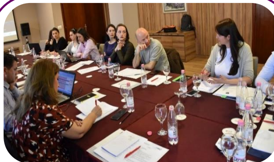
In May, Democracy for Development (D4D) hosted a two-day meeting to present joint comments on the first draft Labor Law to the MLSW.

KWN made progress towards this long-term goal for women to have equal access to employment opportunities in Kosovo by supporting the improvement of a more