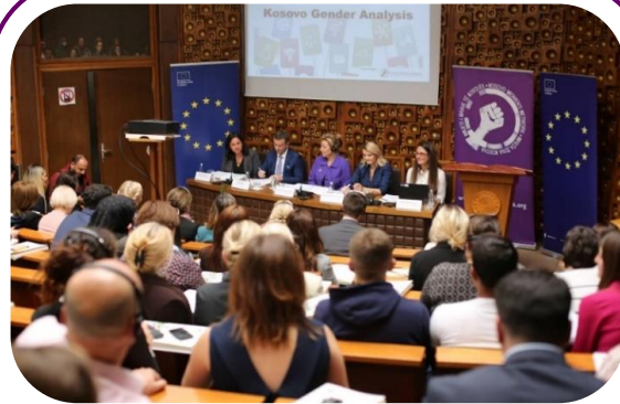
On October 3, the EU and KWN launched the Kosovo Gender Analysis.

KWN continued providing technical support to the EU office, Ministry of European Integration (MEI), Agency for Gender Equality and Gender Equality Officers in integrating a gender perspective into Instrument for Pre-Accession Assistance (IPA) programs in Kosovo, including during planning and implementation phases. To support this process, KWN and the EU published the Kosovo Gender Analysis in October 2018, which brought together all gender-disaggregated data available for each sector. As required by the EU's GAP II, this document is intended to serve the EU and other stakeholders in the planning of more effective actions that incorporate a gender perspective. The report contains recommendations on the objectives and indicators that the EU considers to be a priority, towards advancing gender equality in the areas most in need. KWN used the findings to suggest possible ways through which the EU and Kosovo could incorporate a gender perspective into 10 IPA Action Documents.