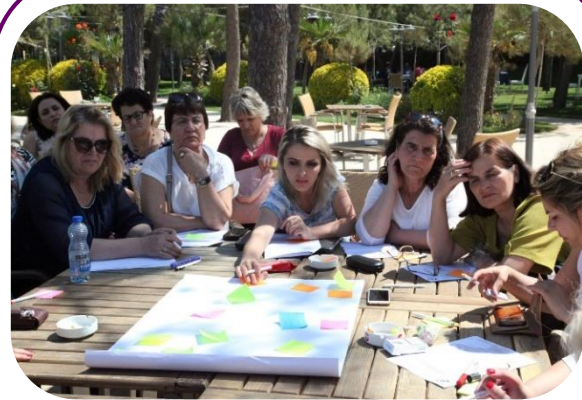
KWN members strategize and draft the new KWN Strategy for 2019-2022 in Dures.

In the beginning of 2018, KWN started planning and elaborating the new KWN Strategy for 2019-2022 through a two-day meeting with its members in April. After collecting information and input from members to supplement the Strategy, KWN held its second meeting in November, where along with its members and associates it finalized the Strategy. It was adopted at the annual Assembly of Members on December 15 in Prishtina.