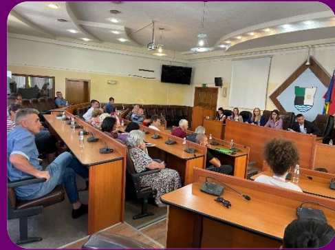
MWAHR engaged women in budget hearings, discussing their priorities for the municipal budget.

In 2023, KWN provided recommendations towards improving the gender perspective in the Law on Budget for 2024 and the Law on Local Finance.