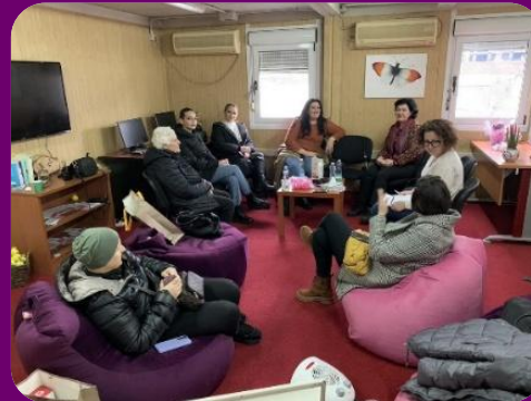
"Workshop Led by KWN Member 'Have Hope' Educates Women on Healthcare Rights and Violations"

The beneficiaries expressed gratitude for the information shared and appreciated having a platform to voice their experiences of healthcare rights violations. During a workshop hosted by NGO Drugeza,