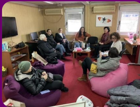
"Workshop Led by KWN Member 'Have Hope' Educates Women on Healthcare Rights and Violations"

The beneficiaries expressed gratitude for the information shared and appreciated having a platform to voice their experiences of healthcare rights violations. During a workshop hosted by NGO Drugeza,