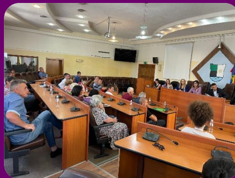
MWAHR engaged women in budget hearings, discussing their priorities for the municipal budget.

In 2023, KWN provided recommendations towards improving the gender perspective in the Law on Budget for 2024 and the Law on Local Finance.