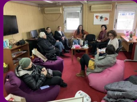
"Workshop Led by KWN Member 'Have Hope' Educates Women on Healthcare Rights and Violations"

The beneficiaries expressed gratitude for the information shared and appreciated having a platform to voice their experiences of healthcare rights violations. During a workshop hosted by NGO Drugeza,