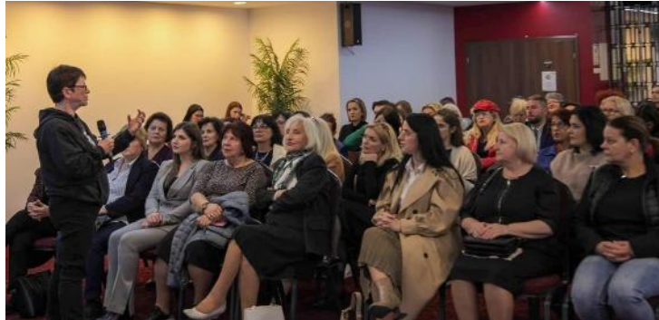
On 9 November 2024, KWN members gathered to discuss achievements, challenges, and strategies for strengthening alliances to advance women's rights and empowerment.