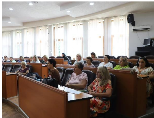
MWAHR engages women in a budget hearing in the Municipality of Mitrovica in 2024.

KWN continued advocacy towards institutionalising gender-responsive budgeting (GRB) via advocacy meetings, letters, and annual budget recommendations sent to the OPM, Ministry of Finance, Labour, and Transfers (MFLT), parliament, and municipalities. KWN emphasised the importance of institutionalising GRB by including it in the legal framework on public finance, currently being amended. While the percentage of budget organisations at the municipal level (89%) and central level (62%) that submit the GRB annex required by the MFLT has increased, not all responsible institutions submit it, the quality of annexes remains lacking, and rarely are they published and made publicly available, despite KWN's advocacy for improved transparency. KWN continued work towards achieving the following immediate results related to this objective in 2024, supported by ADA and Sweden.