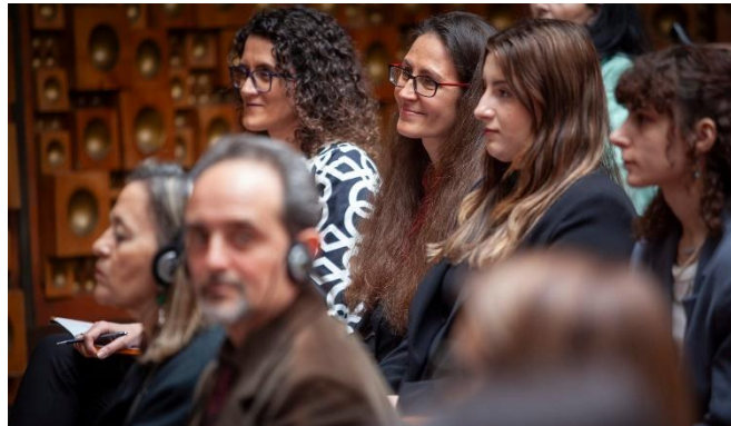
KWN launches its research report, In the Shadows: A Gender Analysis of Informal Work in Kosovo, which highlights gender disparities in informality towards informing government interventions to address informality with an evidence-based, do-no-harm approach.

Additionally, KWN facilitated discussions between WEF and the President of the Republic of Kosovo, Vjosa Osmani Sadriu, OPM, and Ministry of Justice, advocating to address inconsistencies between Kosovo's labour law and EU standards. Through advocacy, KWN and WEF emphasised the need for amending the law to further gender equality in labour. KWN also participated in several conferences and roundtable discussions related to labour, where high-level officials, including MPs, the General Inspectorate, the Labour Inspectorate, the Deputy Minister of Finance, Labour and Transfers, and municipal officials, were present. During these conferences and discussions, KWN raised issues including the need to amend the labour law in line with the EU Directive on Work-Life Balance, among others.