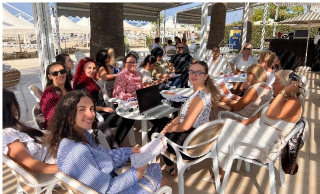
On 26-28 September 2025, KWN members, Board and staff gathered in Durres to connect, reflect, strategise and co-create KWN's new Strategy.

This crosscutting overall objective aims to strengthen the feminist movement in Kosovo, the region and beyond, via all KWN programmes. KWN has made progress towards this overall objective: KWN has a Strategy guiding efforts towards expanding the feminist movement; KWN members remained active through different activities, including four KWN members' meetings held in 2025; and 13 women and men supported KWN financially in 2025. KWN also supported at least 35 Women Human Rights Defenders (WHRDs), contributing to UN Sustainable Development Goal 5, and EU GAP III. To date, KWN has supported more than 5,874 WHRDs. Progress has been made towards this long-term aim related to the following specific objectives and expected results below.